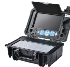
1 × Control Box